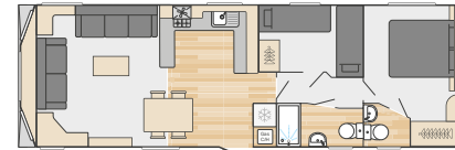
35' x 12' - 2 Bedroom