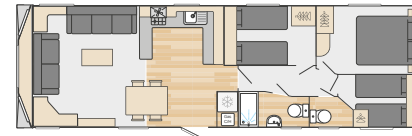
37' x 12' - 3 Bedroom